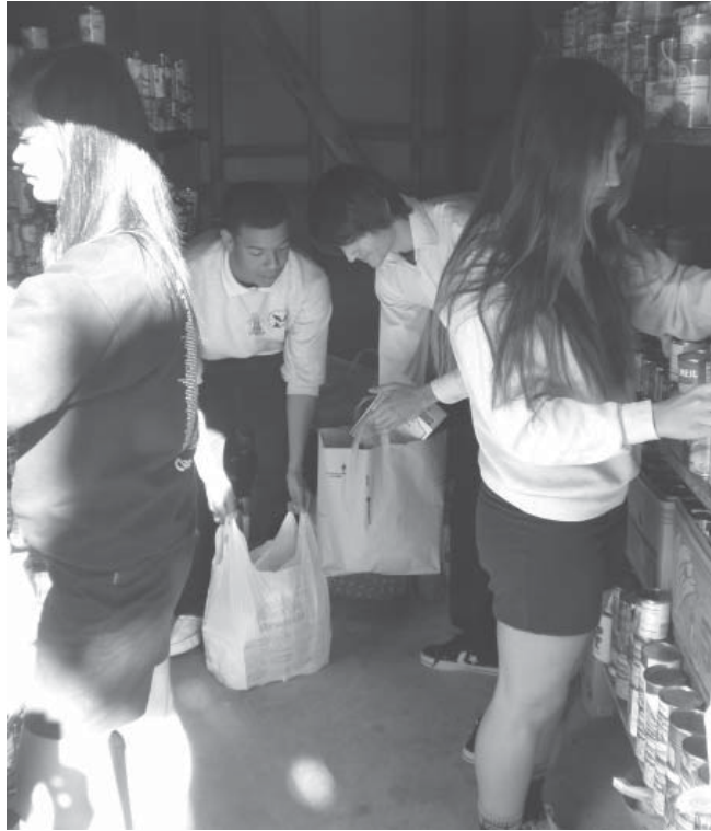
ABOVE: BMHS students load items in the food bank during Homecoming.