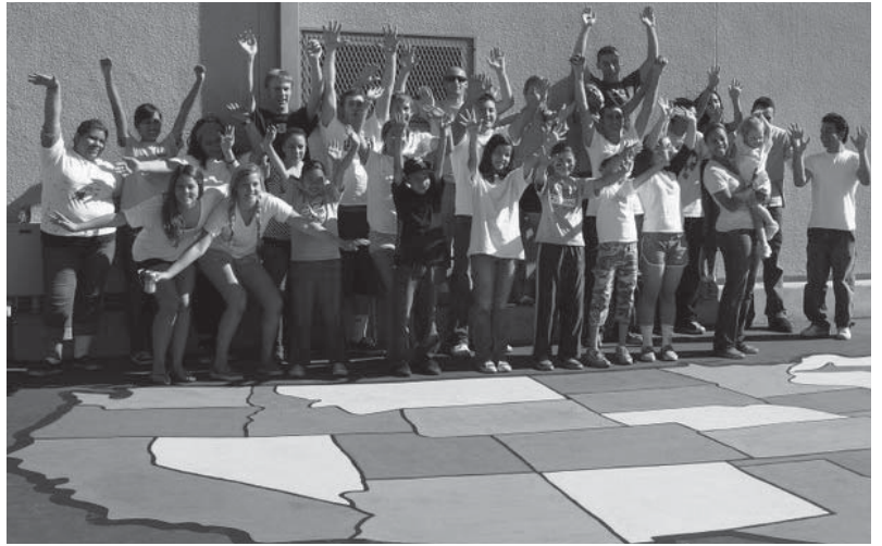
ABOVE: Students from BMHS and San Miguel Elementary show off their mural of the United States.

On November 8, students from the Habitat Club visited San Miguel Elementary School in South Gate to help the children paint a mural of the United States on their playground. The painting was sponsored by "Operation Clean Slate," a non-profit organization which challenges